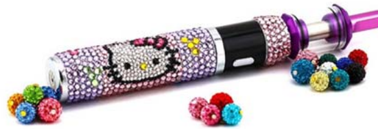
Figure 3: E-cigarette products and accessories.

The use of cartoon characters in advertising and promoting of e-cigarettes as fashion accessories are other ways these products appeal to youth with the implication that these products are harmless (see Figure 3). E-cigarette manufacturers report sponsoring concerts, sporting events, and parties that include the distribution of free samples; many of these events occurred in California. 32 Another tactic to create a perception that e-cigarettes are family friendly is through the association of these products with family oriented attractions.